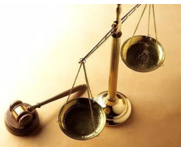
Figure 1 The imbalance between morality and law skews the balance between people's legal concept and moral thought

Now there is a word in the Internet and reality : " moral kidnapping ", the society began to focus on the study of the moralization of law, especially in the modern era of network multimedia, the transmission of information is extremely rapid, people can get their own interest in information and news through more media channels, which also makes it known that more moral disorder and moral kidnapping, as well as the bad atmosphere of morality, such as domestic violence, moral extortion, improper marriage derailment and other scandals such as network media news platform, for people's life has brought more rich discussion "material" material ", which greatly enriched people's life amateurs life. At the same time, it also sounded the alarm for the moral level of society and people's moral imbalance [1].