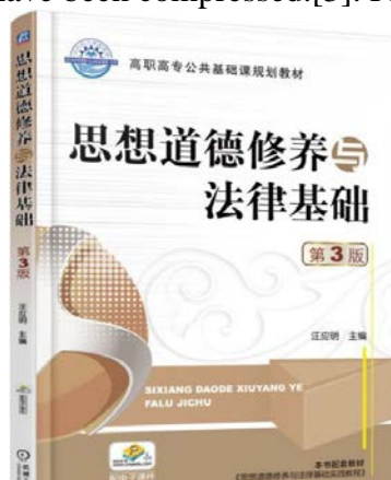
Figure 3 The third edition of ideological and moral cultivation and legal basis published by mechanical industry press

and moral cultivation and the contents of the course materials of the basic law, the relevant contents of the basic law education have not been expanded and the key points have been revised, and even the contents of the legal education have been compressed.[3]. Figure 3